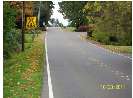
Line Road Looking North (current condition)

This project scope was refocused from Bradley and Line Roads, to Line Road, adjacent to the Lynden Middle School. Design plans are 75% complete and will reconstruct this section of Line Road to City arterial standard with two travel lanes, bike lanes, sidewalks and utility upgrades, as needed. Current schedule is advertising for bids Spring of 2017 with construction projected for Summer 2018. The project is 100% TBD funded.